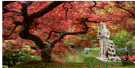
Natural landscapes can be enhanced with just a single accessory or overpowered with too many—Use caution.

Just as landscapes and hardscapes occur in nature, good hardscape design: