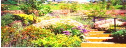
Hardscapes add visual interest and functionality to your garden.

It doesn't take a psychologist to figure out that we enjoy what is familiar and pleasing to the eye, which is why hardscapes are such an important part of landscape design. The hardscape structures you install this Spring can still cheer you in Winter, long after tropical blooms have withered—perhaps with the addition of a cozy fire pit to chase away the chill.